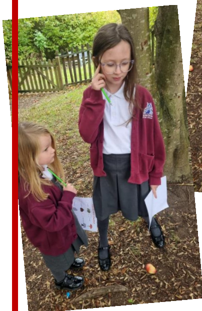
On Tuesday, After School Club enjoyed an Autumn Hunt:

Well done to our young artists for helping to keep both our wildlife and community safe.