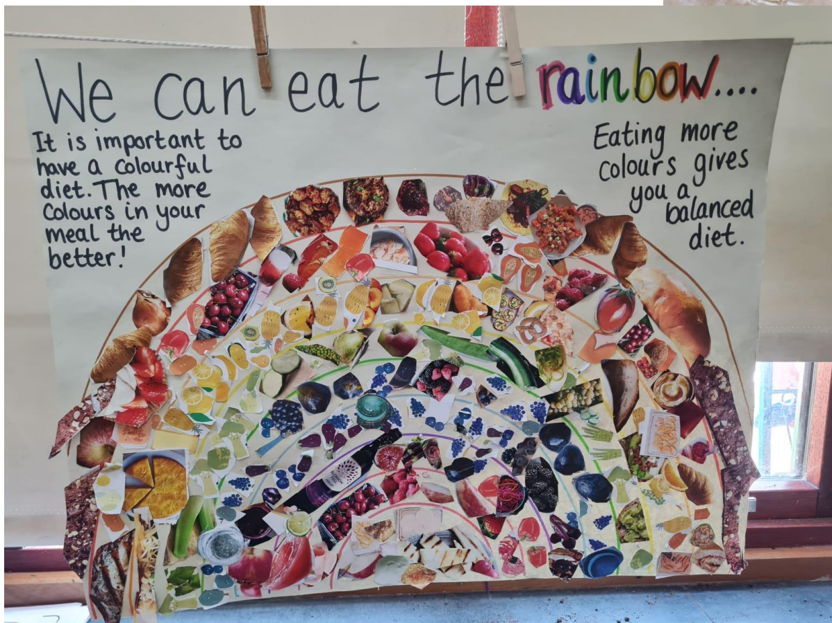
Robins Class made a colourful collage this week to help them learn about healthy eating.